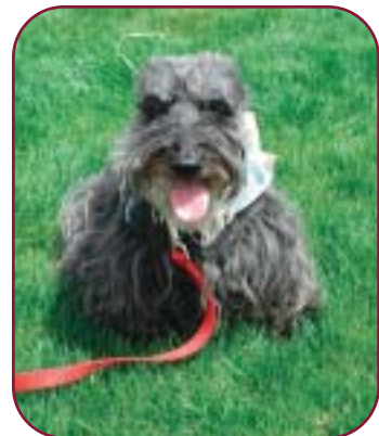
Kiltie relaxes in the sun at Siena's Pet Park.

We encourage all pet owners to use the park. Please remember pets must be on a leash at all times and to please pick up after you pet, this way all pets and owners may enjoy a clean and safe pet friendly park.