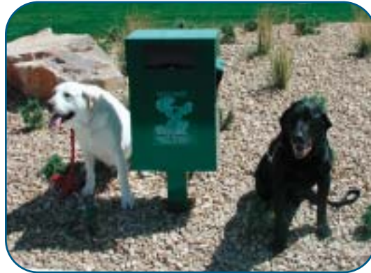
Boomer and Zach pose next to the complimentary bag and disposal unit.

Did you know there is a new pet friendly park located on Fiore Bella Boulevard? This exciting addition to Siena, features shade trees, park benches, complimentary bags and disposal units and lots of grassy area for your pet to roam.