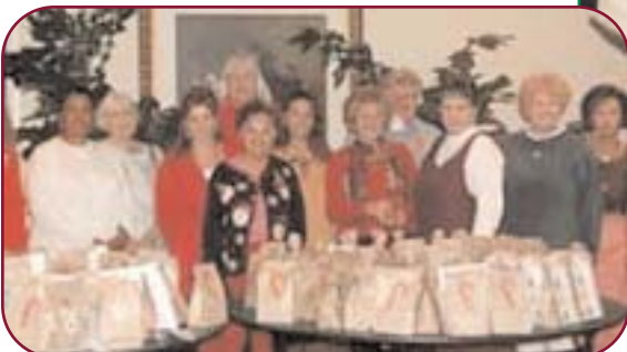
Residents get their cookies ready at the Holiday Cookie Exchange