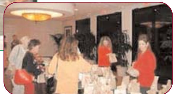
Everyone picks out their cookies to take home