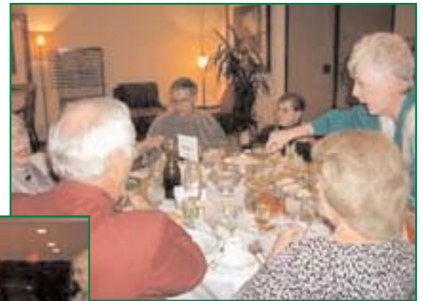
Thanksgiving "Siena" style