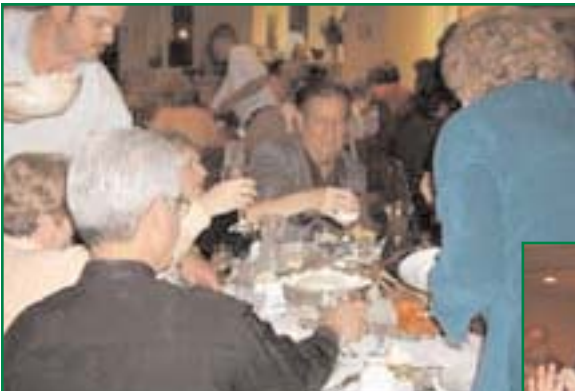
Homeowners toast the Siena Lifestyle at the Thanksgiving Feast