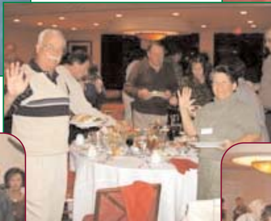
Good food, friends and music were all a part of the Thanksgiving Celebration